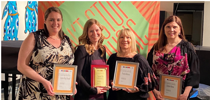
2021 Award Recipients: